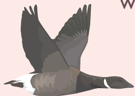
Black-bellied Brent Goose

Warren Refuge is also one of the most important high-tide roosts on the estuary.